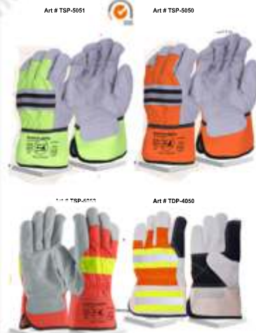
Art # TSP-5051